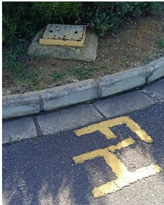
Figure 1: Identification of a MV Fire Hydrant location

Please see the illustrations (Figure 1 and Figure 2) below regarding the markings of the fire hydrants and their locations.